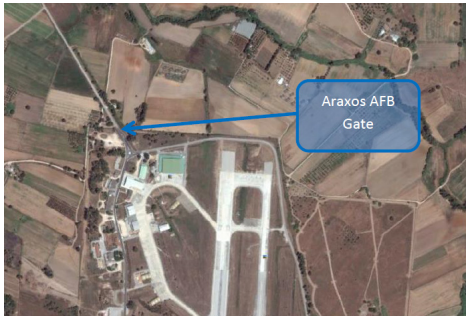
Araxos AFB Gate